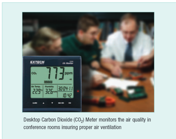
Desktop Carbon Dioxide (CO 2 ) Meter monitors the air quality in conference rooms insuring proper air ventilation